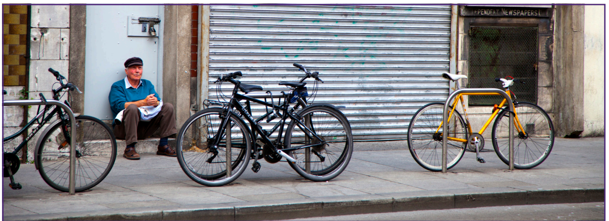
'Abbey Street' taken by a member of the Ana Liffey Stabilisation Group Photography Project.

As we move forward, my goals as Chairperson are for the organisation to sign off as being fully compliant with the Governance Code and to continue to ensure that we manage our resources in an efficient and responsible manner in accordance with our mission statement. Our strategy is also up for review in 2014, and in relation to this, key priority areas are likely to be a focus on fundraising and improvements in resource management. We have now experienced more than five years of cutbacks and it is not realistic that we can continually 'do more with less' year on year. We need to diversify our funding base which may also involve creative and progressive ways of thinking about service development and delivery at the Ana Liffey. We also need to ensure that our operational processes are aligned and supportive of our strategy and the people engaging with them.