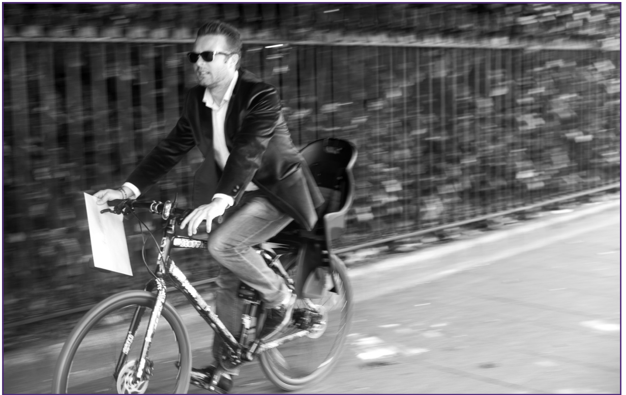
'Cyclist' taken by a member of the Ana Liffey Stabilisation Group Photography Project.

Outside direct service delivery, we continued to work on strengthening the organisation for the future and progressing our strategic priorities. We have identified the key legal issues in introducing Medically Supervised Injecting Centres in Ireland and are working in a systematic way to create an environment in which such services could be a reality for Ireland. We have developed plans for, and are eager to deliver on, a low threshold residential stabilisation service.